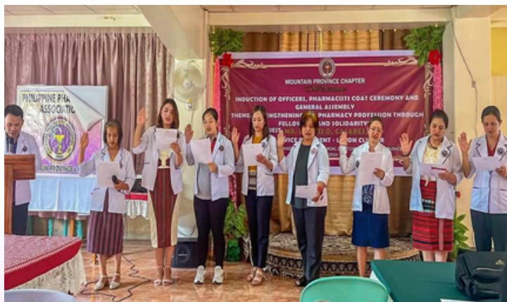
Mountain Province Chapter May 25, 2024