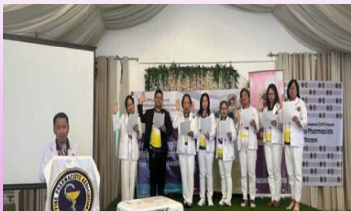
Batangas Chapter September 28, 2024