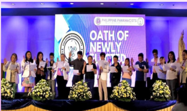
Rizal Chapter November 14, 2024