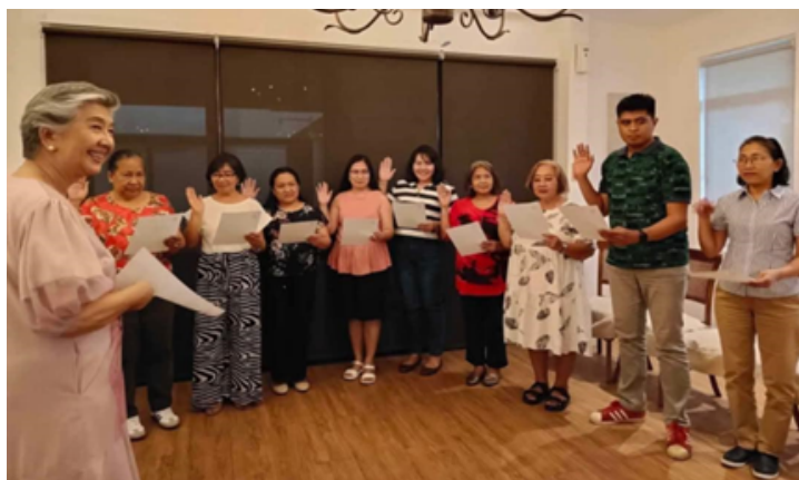
Cavite Chapter, July 6, 2024