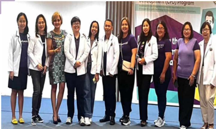
Pampanga Chapter September 28, 2024