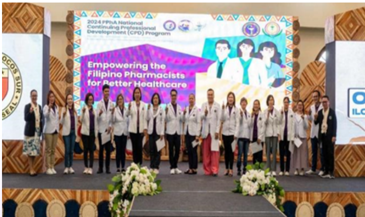
Ilocos Sur-Abra November 23, 2024