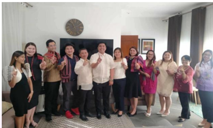
Baguio-Benguet Chapter March 15, 2024