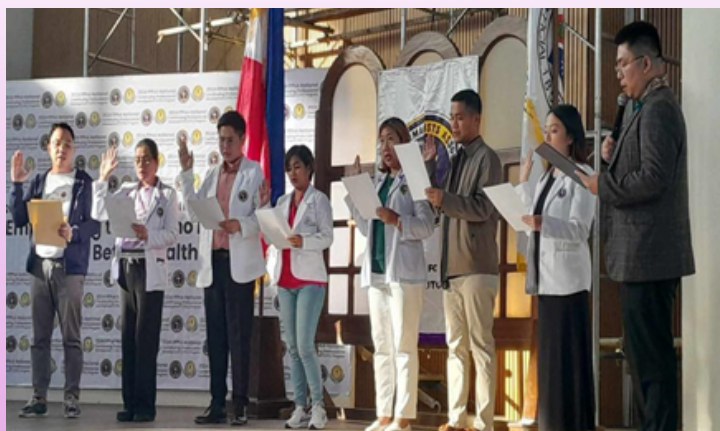
La Union Chapter August 11, 2024